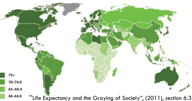
Life Expectancy and the Graying of Society", (2011), section 6.3 from the book <u>A Primer on Social Problems</u> (v. 1.0)

With a life expectancy of 79 years, the US lags behind many other developed countries, placing 33rd out of 193 countries. In healthy life expectancy, where "years of illhealth are weighted according to severity and subtracted