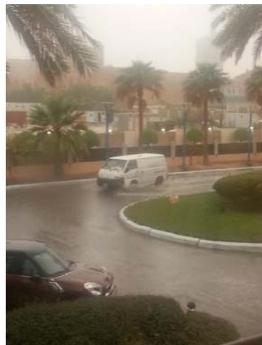
/iew from hotel room in Al Khobar, Saud Arabia

One consultant recently undertook a whirlwind tour of the Middle East to train Noble Drilling employees in the Fundamentals of vPSI Problem Solving (the entrylevel vPSI class). Destinations include Qatar, a surprisingly wet Saudi Arabia, and the United Arab Emirates.