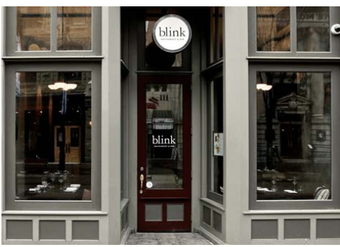
blink (sic) Restaurant and Bar in Downtown Calgary

found in this elegant restaurant is more than complemented by the cuisine. From the appetizer to the dessert, not a note was missed by the chef. Friendly and efficient service rounded out the experience to make for a couple of happily sated vPSI consultants.